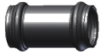
Straight Connector (Repair Coupling)